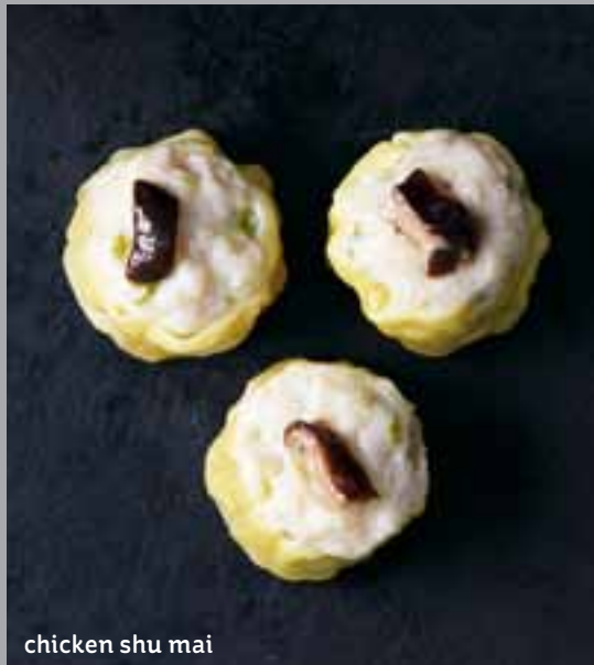
chicken shu mai