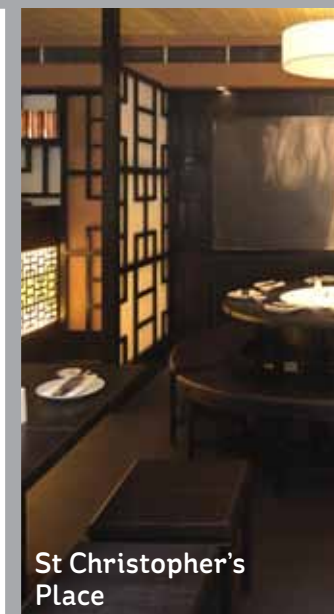
St Christopher's Place