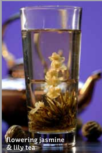
flowering jasmine & lily tea