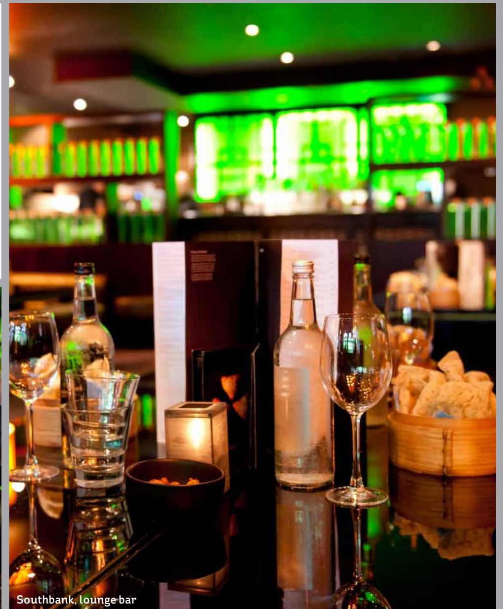
Southbank, lounge bar