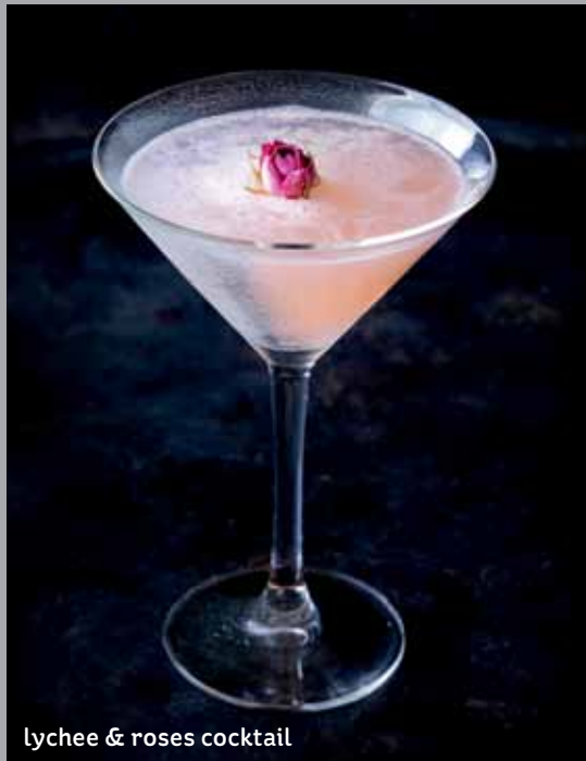
lychee & roses cocktail