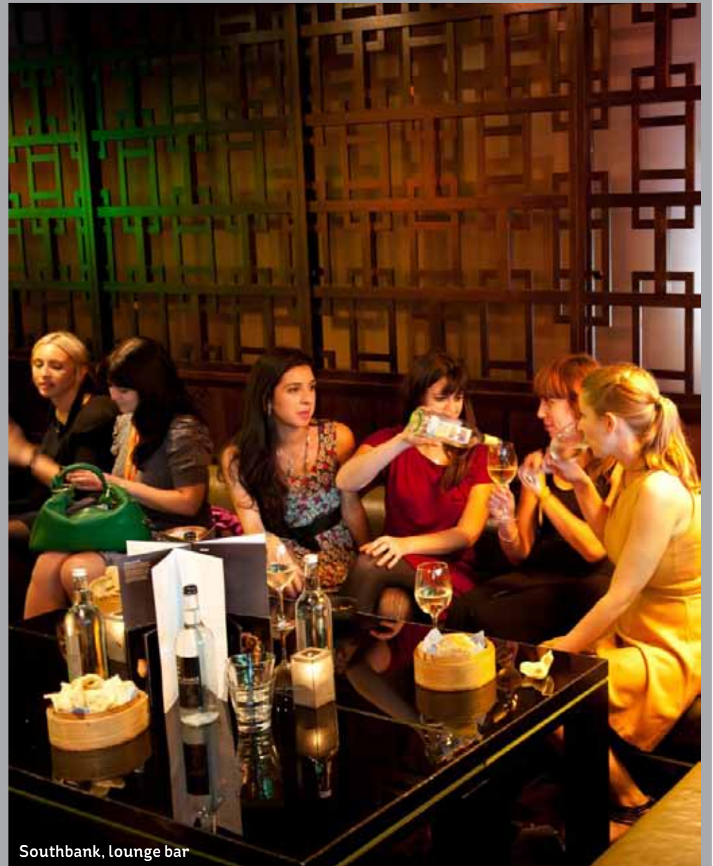
Southbank, lounge bar

So join the select few who have found the surreptitious answer to enjoyment.