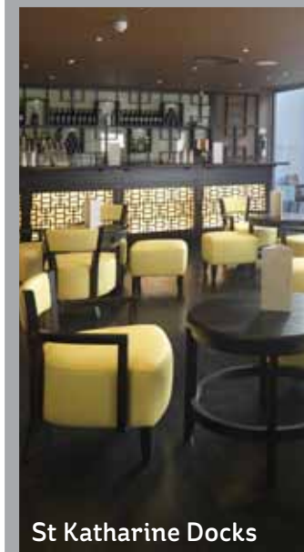
St Katharine Docks

Quayside Tower Bridge House St Katharine Dock London E1W 1BA