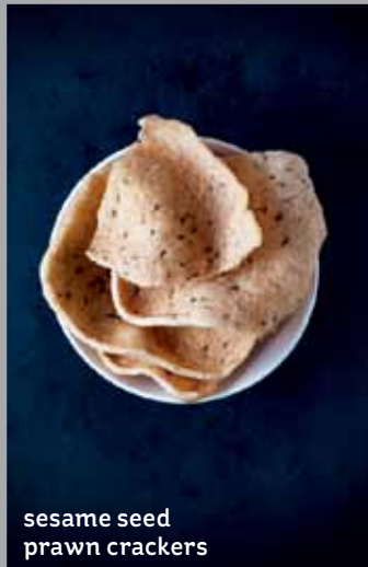
sesame seed prawn crackers