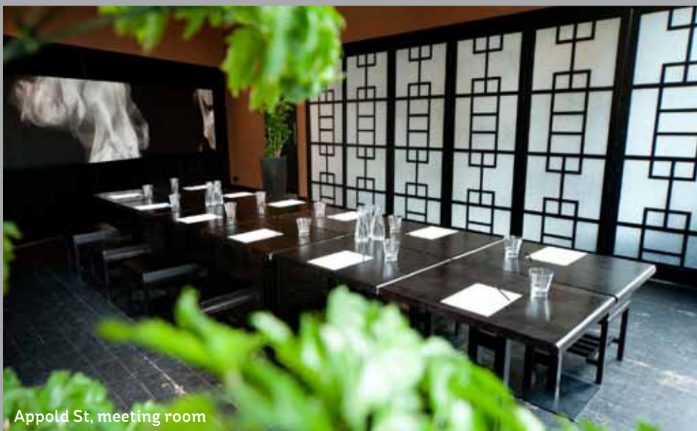
Appold St, meeting room

For screen, projector and further audio visual, prices available on request.