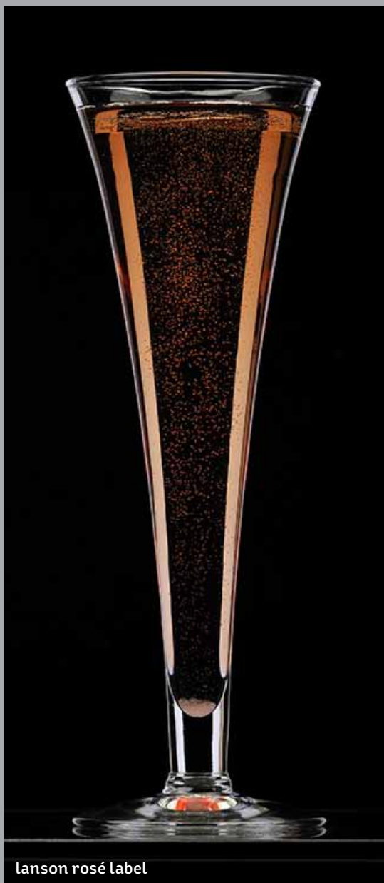
lanson rosé label