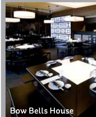
Bow Bells House

Bow Bells House, 1 Bread Street London EC4M 9BE