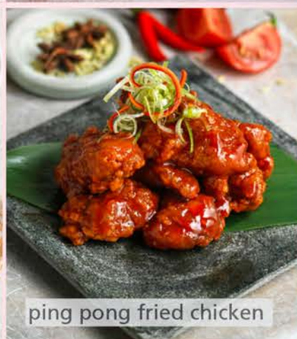
ping pong fried chicken