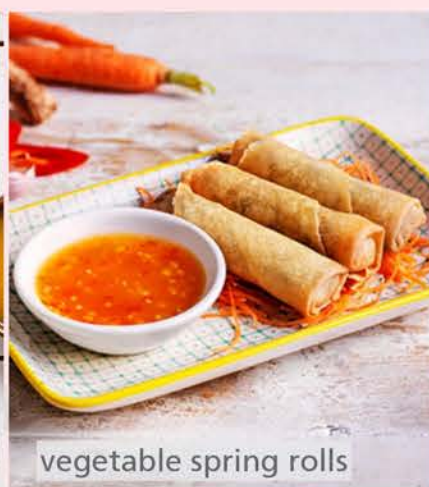
vegetable spring rolls