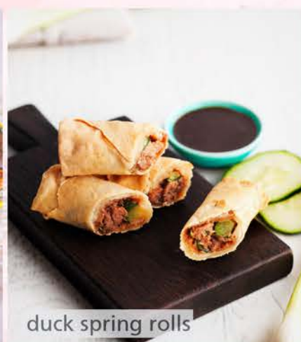
duck spring rolls